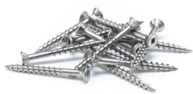
FS 001 4 x Fixing Screws