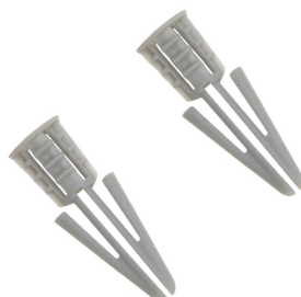
WP 001 4 x Wall Plugs